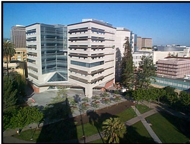
Martin Luther King Library on SJSU campus

SJSU Library: All students will be provided with access to the online resources of the SJSU Dr. Martin Luther King Jr. library. In addition, students will be able to access the resources of other university libraries through the King library. Go to http://www.sjlibrary.org/services/distance/index.htm for information on the MLK library.