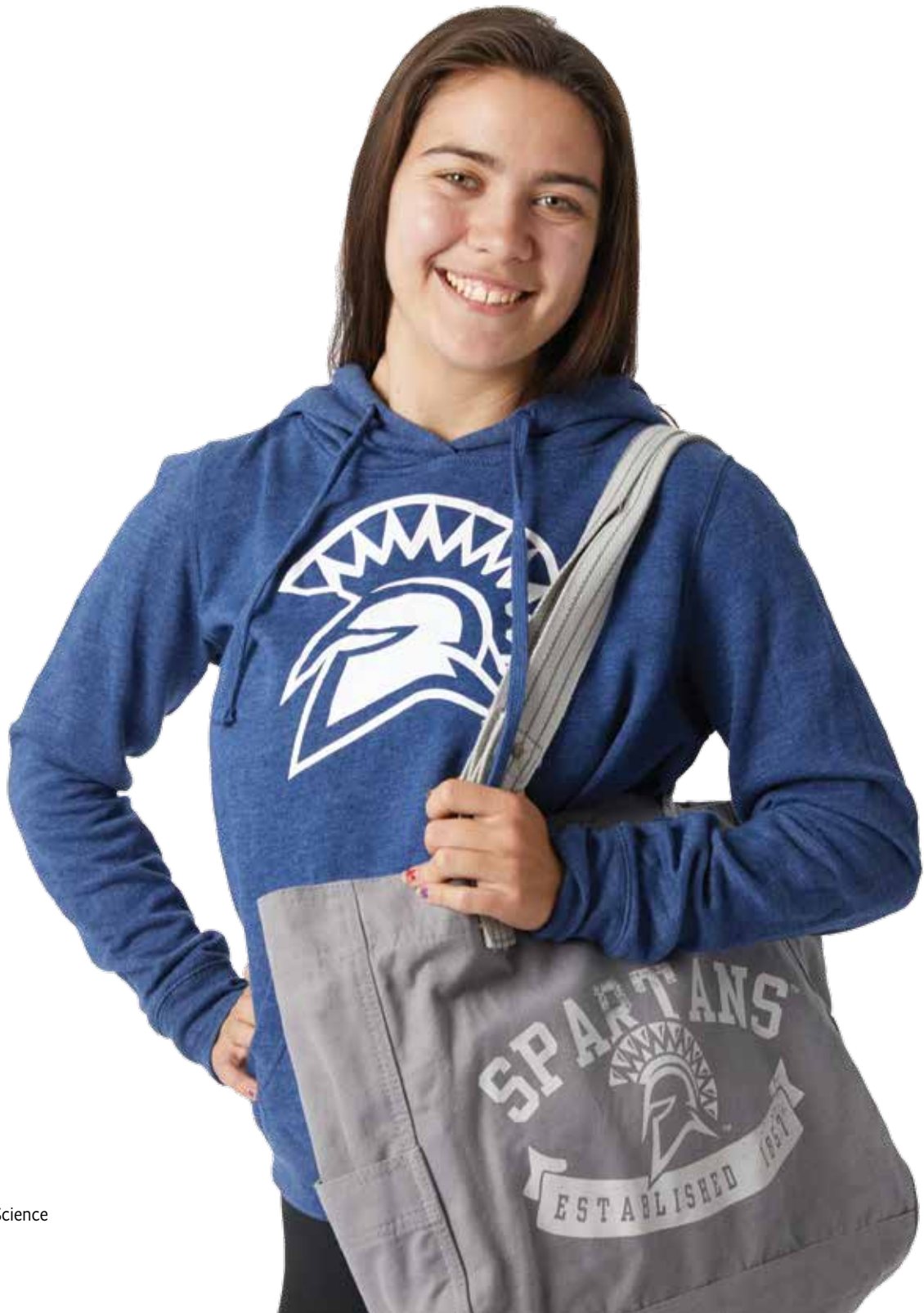
Lindsey Health Science