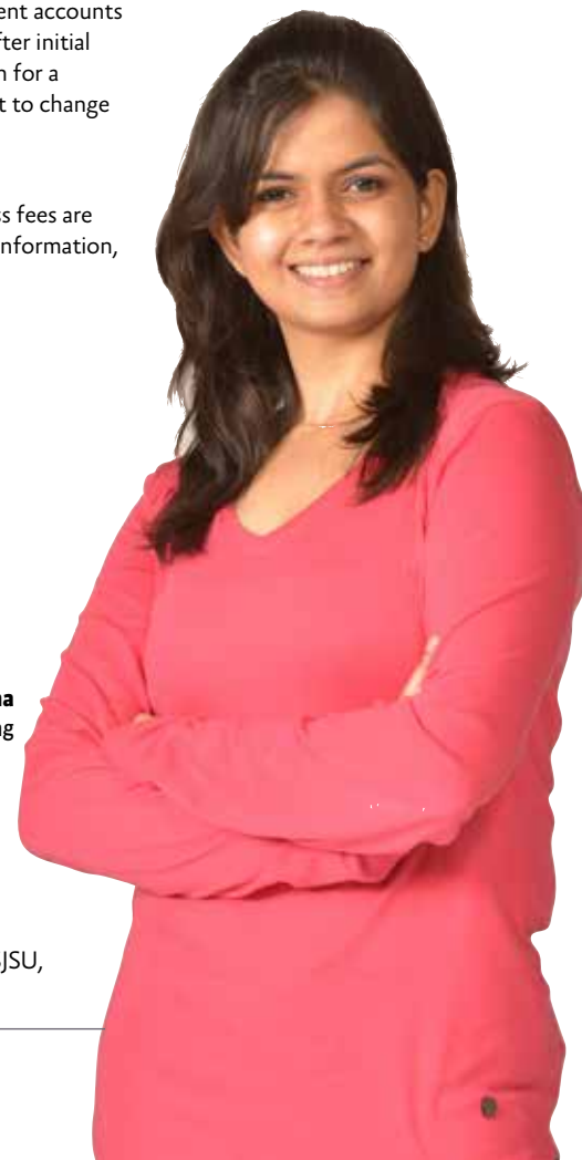
Deepna Software Engineering

With Direct Deposit, you receive your refund several days earlier than a paper check. To enroll, login to MySJSU, scroll to Finances, and select Enroll in Direct Deposit. To learn more visit sjsu.edu/bursar