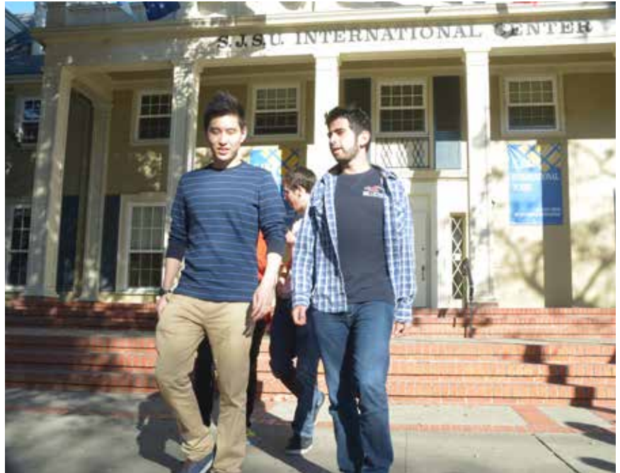
Campus Village left; International House, right