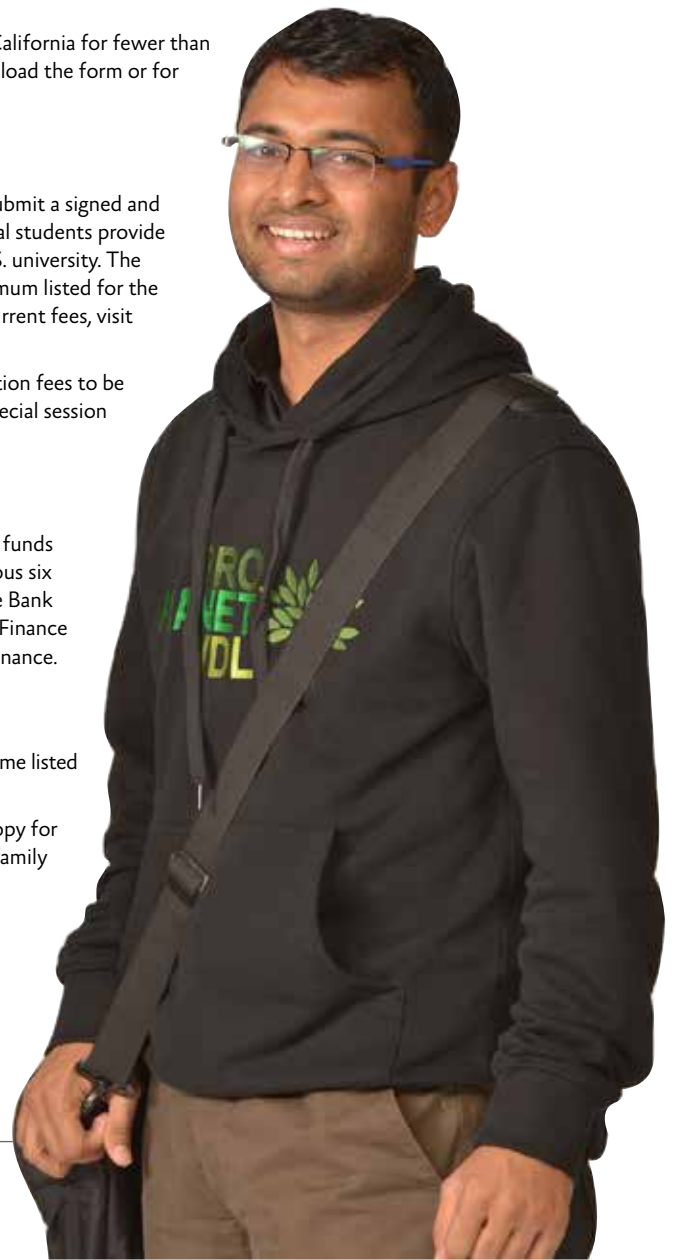
Amol Software Engineering

Please note: If dependents will be accompanying you, you must also submit a passport copy for each of your dependents and provide proof of funding for an additional $5,000 for each family member.