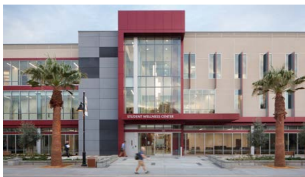
Student Wellness Center

Many new undergraduates in the Colleges of Science, Engineering, and Business need to take the Calculus Placement Exam prior to registration. For details, exemptions, and other criteria, visit sjsu.edu/math/calculus